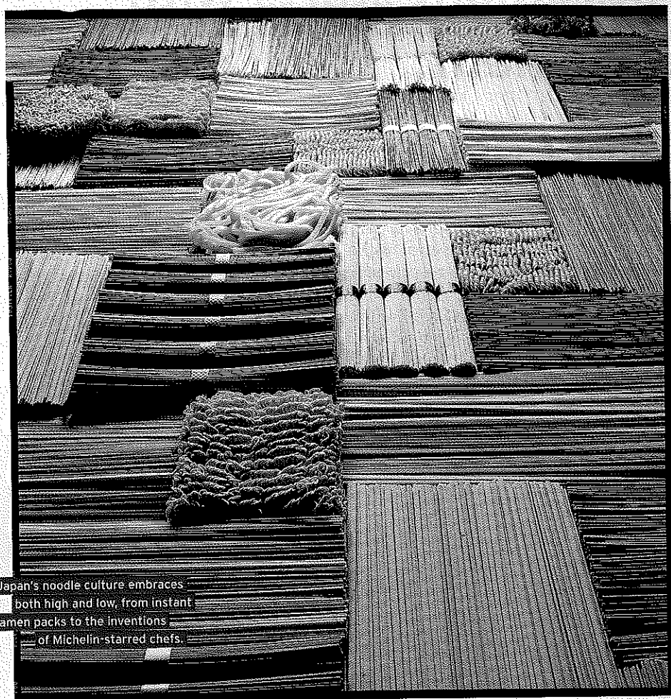
Japan's noodle culture embraces both high and low, from instant ramen packs to the inventions of Michelin-starred chefs.